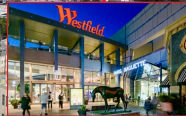
SHOPS AT SANTA ANITA