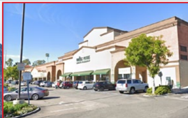
WHOLE FOODS MARKET