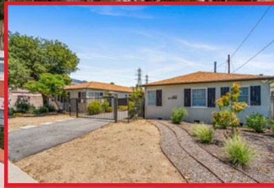
60 EL NIDO AVE