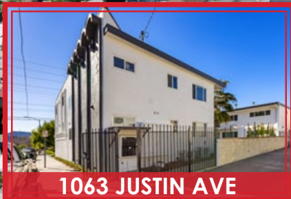
1063 JUSTIN AVE