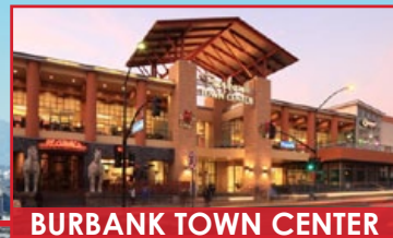
BURBANK TOWN CENTER