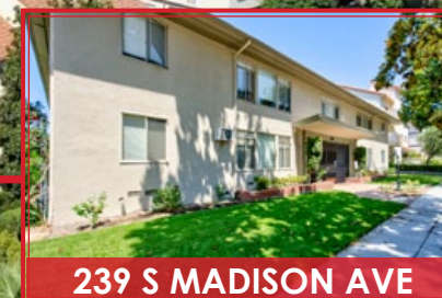
239 S MADISON AVE