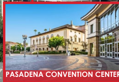
PASADENA CONVENTION CENTER