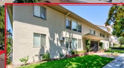
239 S MADISON AVE