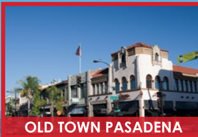
OLD TOWN PASADENA