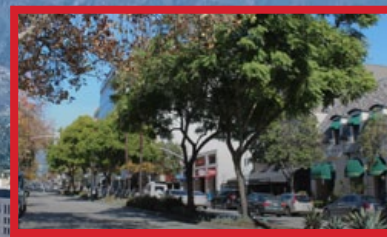
SOUTH LAKE AVE DISTRICT