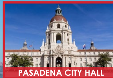
PASADENA CITY HALL