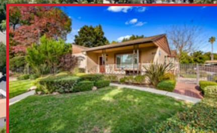
517 E WASHINGTON