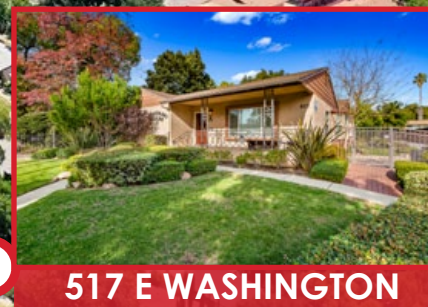
517 E WASHINGTON