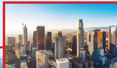
DOWNTOWN LOS ANGELES