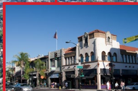
OLD TOWN PASADENA