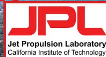
Jet Propulsion Laboratory California Institute of Technology