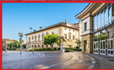
PASADENA CONVENTION CENTER