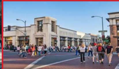
OLD TOWN PASADENA