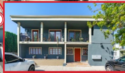
425 N RAYMOND AVE